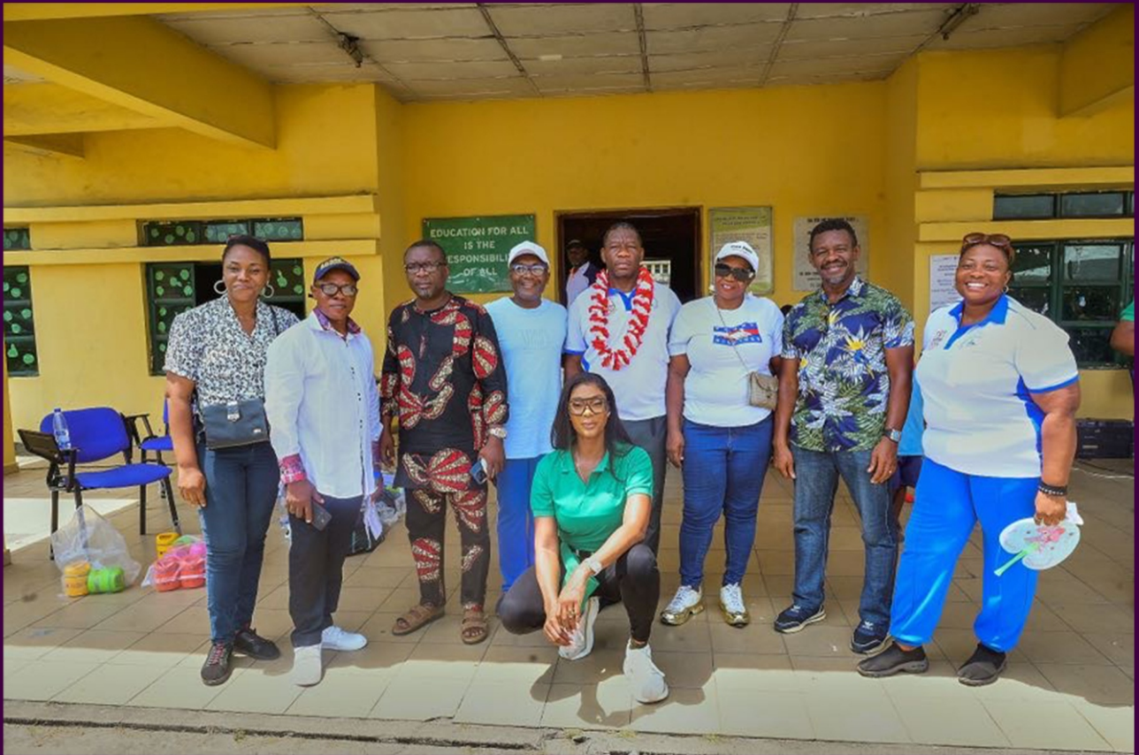
THE OLD BOYS AND GIRLS ASSOCIATION CLASS OF 1984